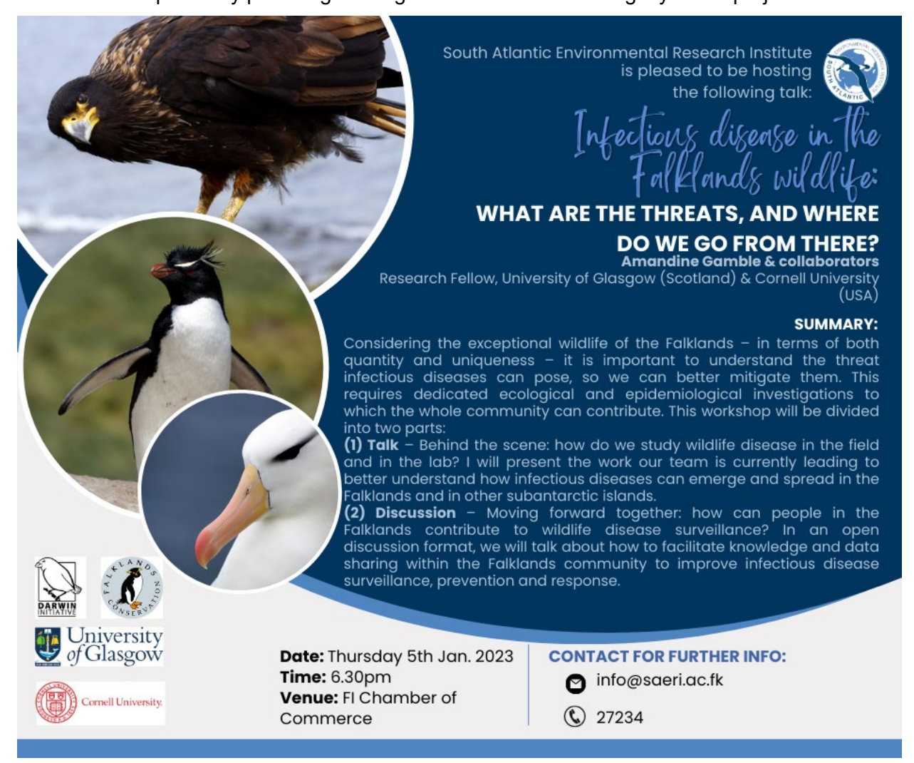
Figure 2. Flyer of the public talk and discussion session led in Stanley by the project team (advertised on <u>Facebook</u> and <u>Twitter</u>, and attended by ~50 people, corresponding to the full capacity of the seminar room).

Engagement of private landowners was discussed during site visits . These included, in addition to the sites we were already planning to visit for routine data and sample collection: